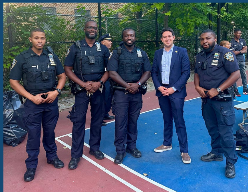
National Night Out Against Crime with NYPD