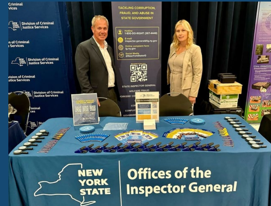
Members of Team OIG handing out materials at a DCJS event