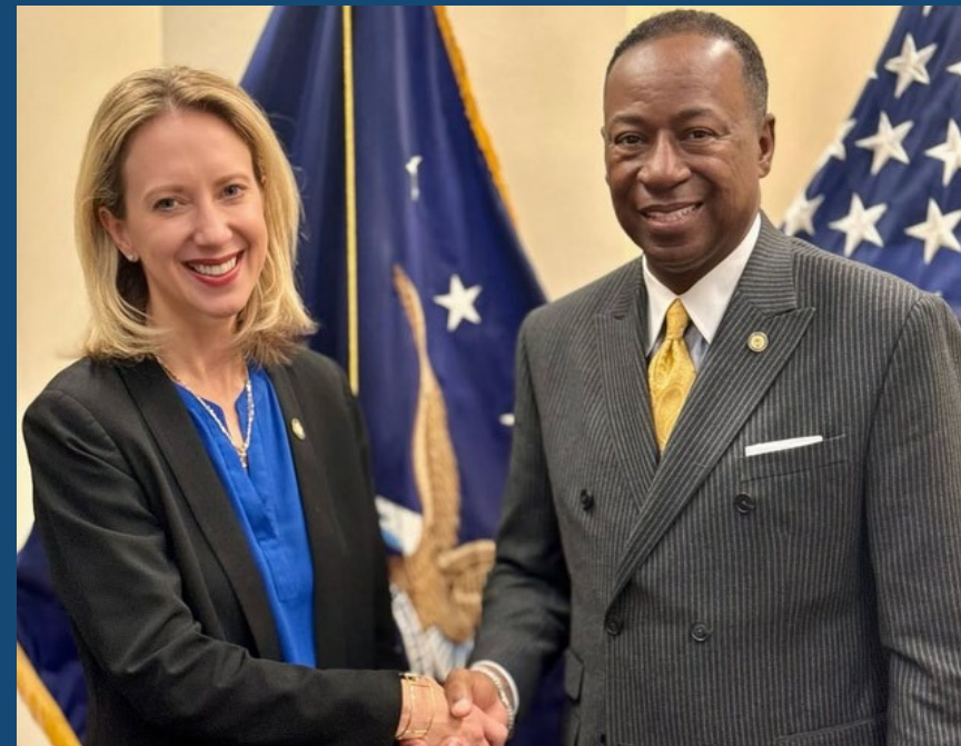
IG Lang with then U.S. Department of Labor IG Turner