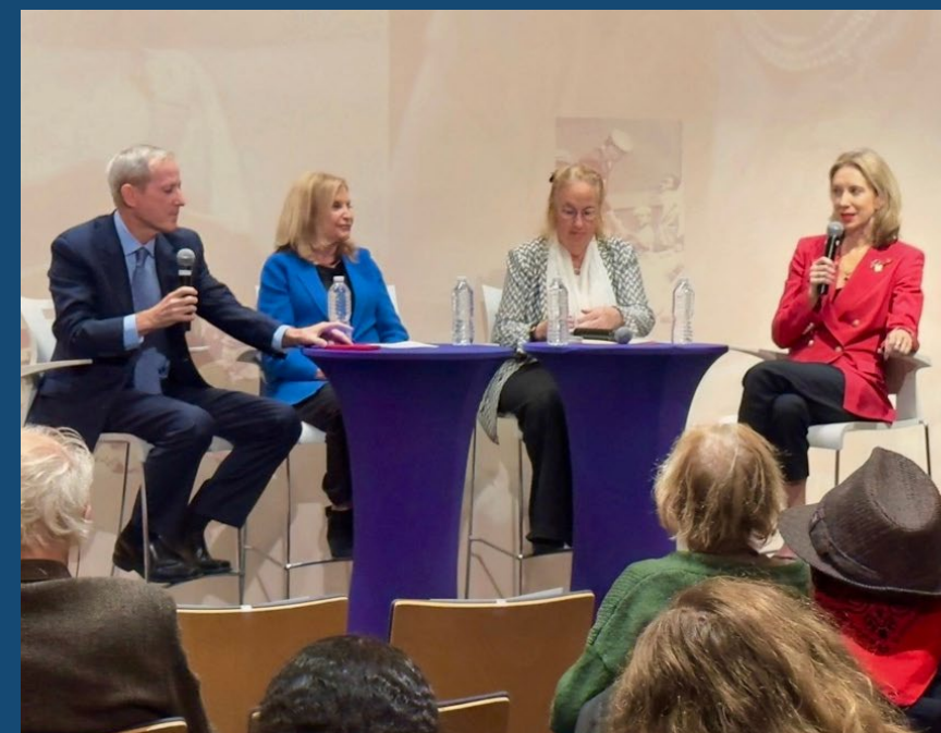
IG Lang speaking at a public event